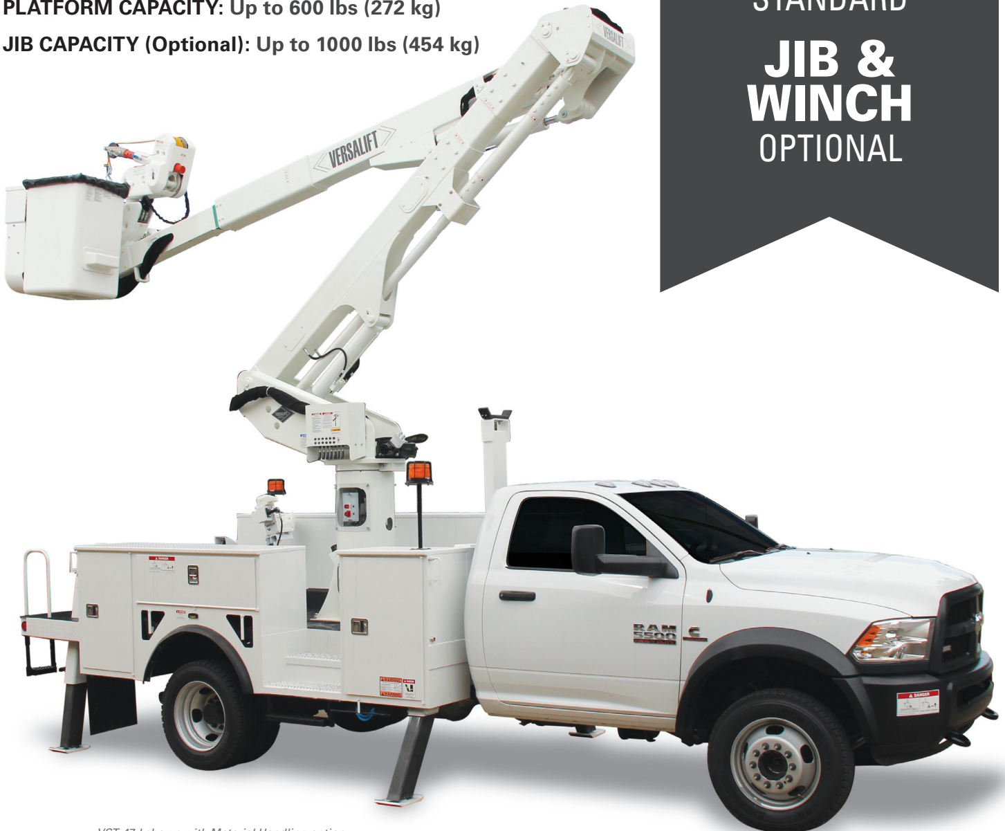
VST-47-I shown with Material Handling option.

JIB CAPACITY (Optional): Up to 1000 lbs (454 kg)